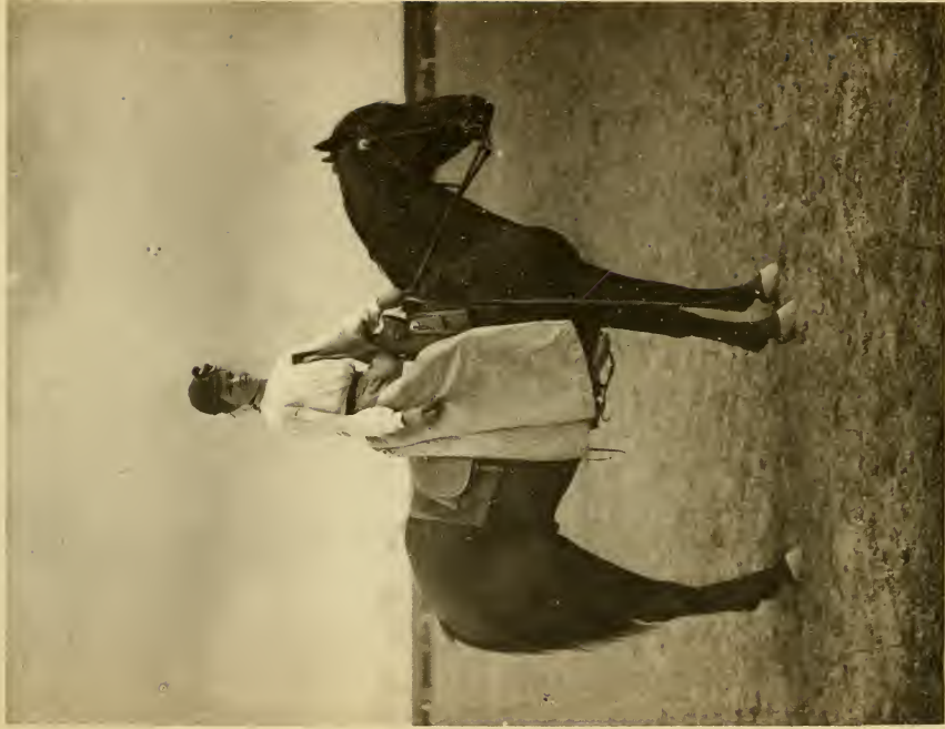
WINNER OF COWGIRLS' RACE.